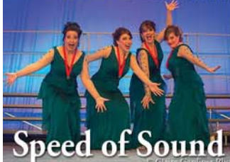
Speed of Sound