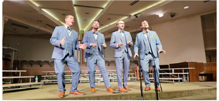
After Hours Show Performance