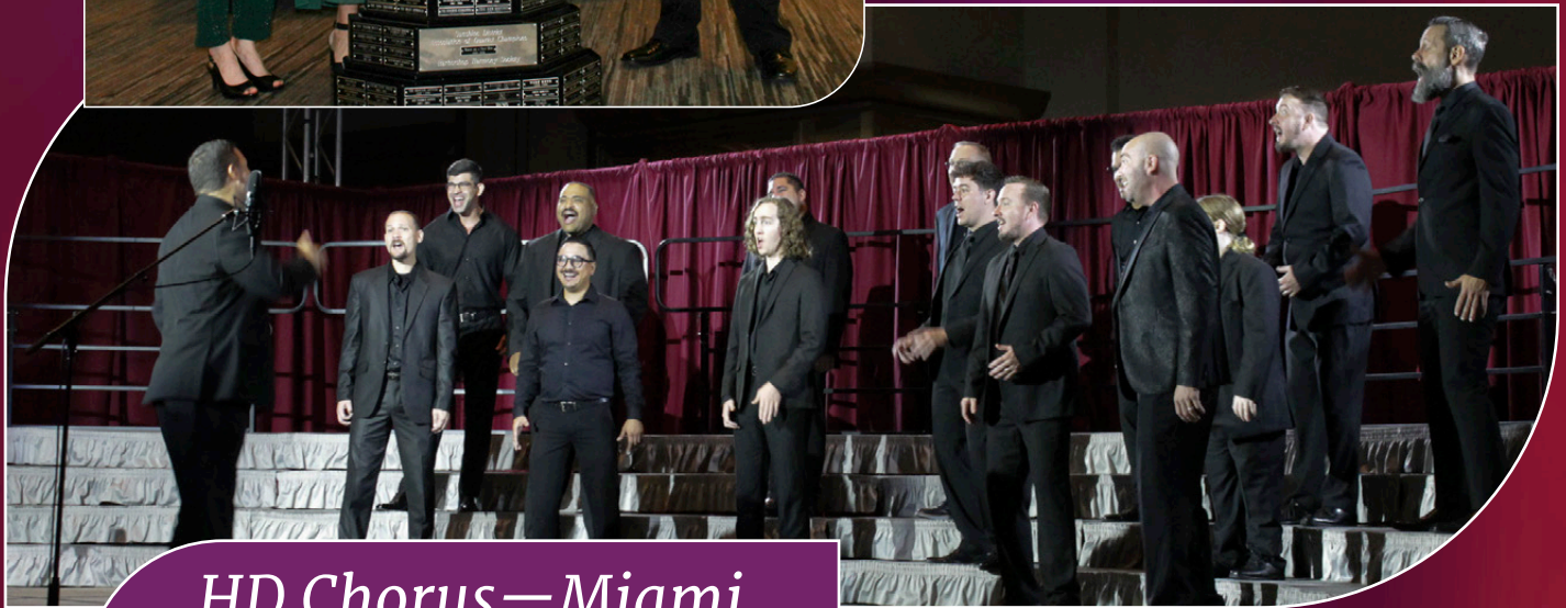
HD Chorus—Miami Intl Prelim Chorus District Representative (SUN) — Fall Convention, 2024 —