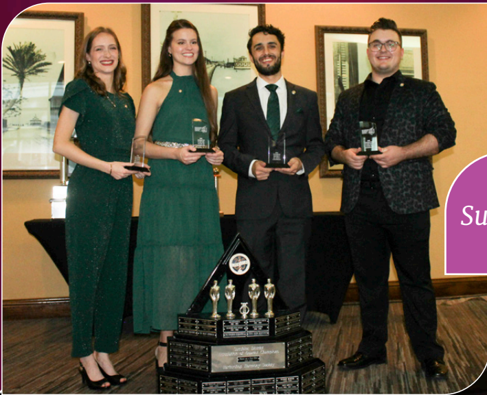
Tonal Fusion Sunshine District Quartet Champions — Fall Convention, 2024 —

QUARTERLY NEWSLETTER OF THE SUNSHINE DISTRICT BARBERSHOP HARMONY SOCIETY