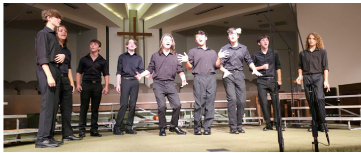
Niceville High School Barbershop Boys