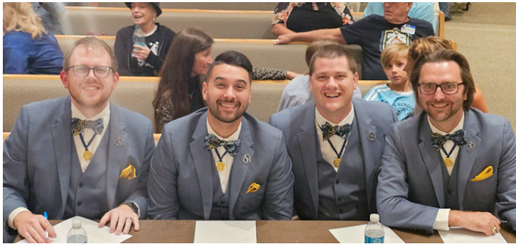
After Hours Judging Chorus Competition

The Festival was a great success in that all the barbershoppers (over 100 from Mobile to Tallahassee) had a great time. Here a few pictures from our weekend. We invite any and all barbershoppers to join us next year, the first weekend in October 2025.